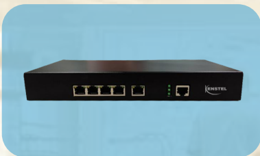
High performance LTE router

Our enterprise LTE Routers are specifically engineered to meet the demanding networking needs of businesses, government agencies, educational institutions, and more.